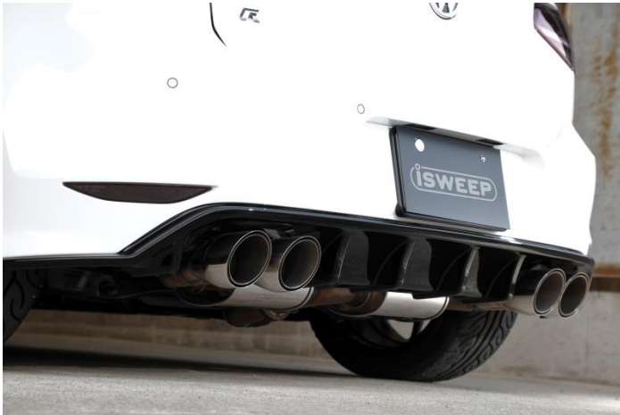
【iSWEEP Rear Diffuser DTM Style】