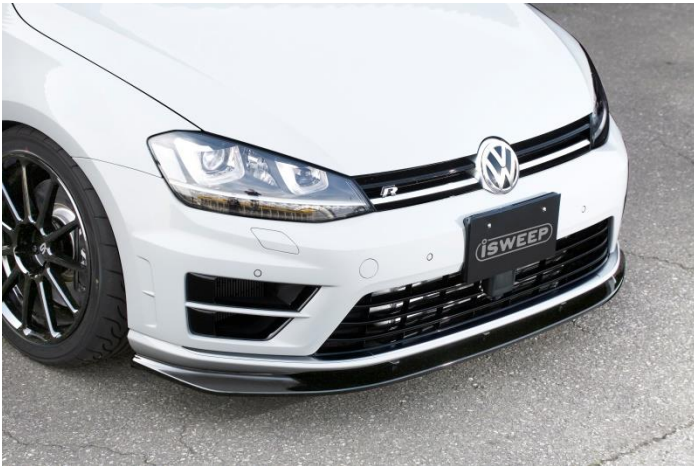
【iSWEEP Front Lip Spoiler】