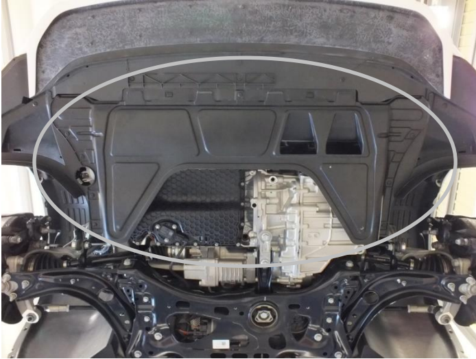
Engine Under Cover