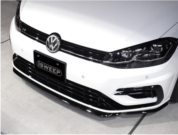
[iSWEEP VW Golf 7.5R Front Lip Spoiler]