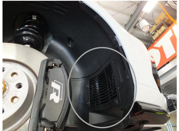
Left & Right Inner Fender Panels